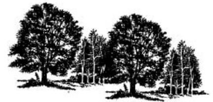
trees, parks, forests