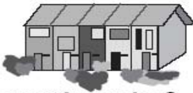
apartments & townhouses