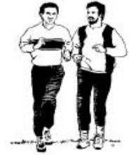
walking & jogging trails